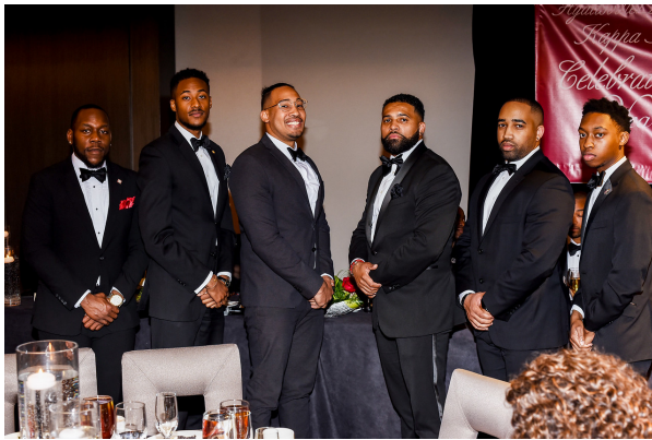
Young Brothers reciting Kappa of My Dreams