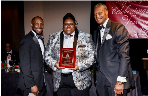
Jodie Sanford Memorial Recipient